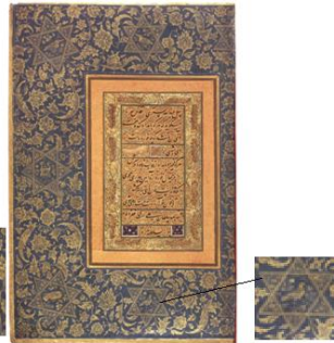
Pl.6: Calligraphy( Welch et al. 1987:Pl.30)