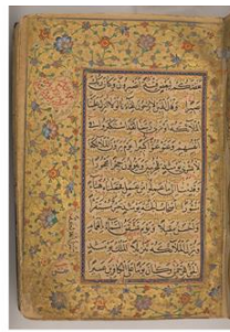
Pl.2 Qur'anic leaf of Ibrahim Sultan, Iran (Shiraz), A.H. 830/A.D. 1427.