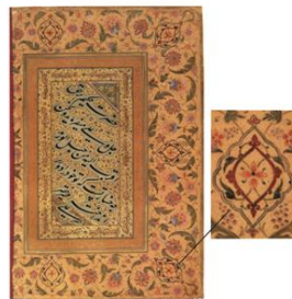
Pl.7: Calligraphy (Welch et al.,1987:Pl.19)