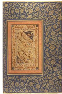
Pl.5: Calligraphy( Welch et al.1987, Pl.30)